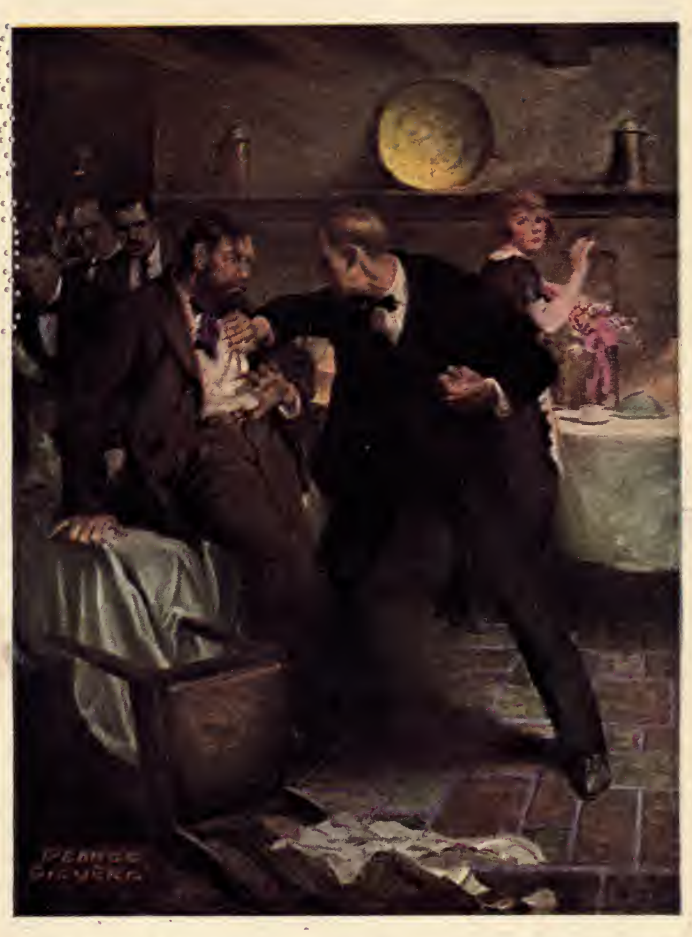
hard knuckles pressed cruelly into the soft throat of the villager (page 62)